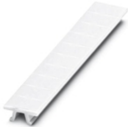
Zack marker strip, 10-section, horizontally labeled with the consecutive numbers: 111 ... 120, white, width: 6 mm

Please be informed that the data shown in this PDF Document is generated from our Online Catalog. Please find the complete data in the user's documentation. Our General Terms of Use for Downloads are valid ( http://phoenixcontact.com/download )